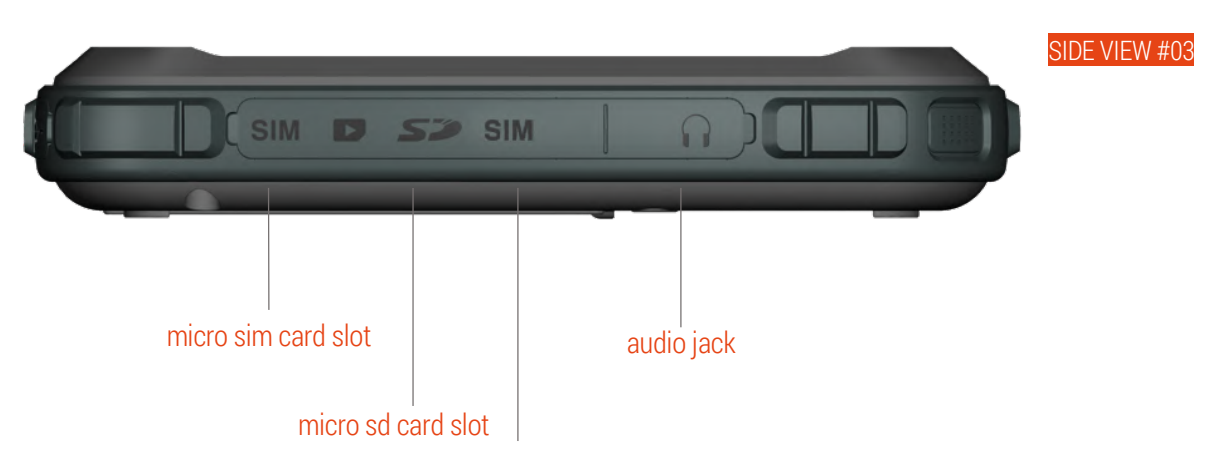
micro sim 2 card slot